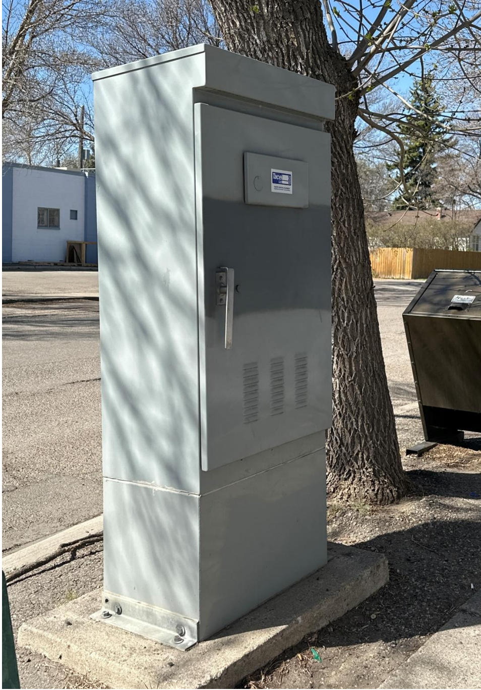
Location #2: 7 th Ave N and 13 th Street N (Northwest corner) Cabinet model. Approximate dimensions: 62" (h) x 17" (d) x 30" (w)