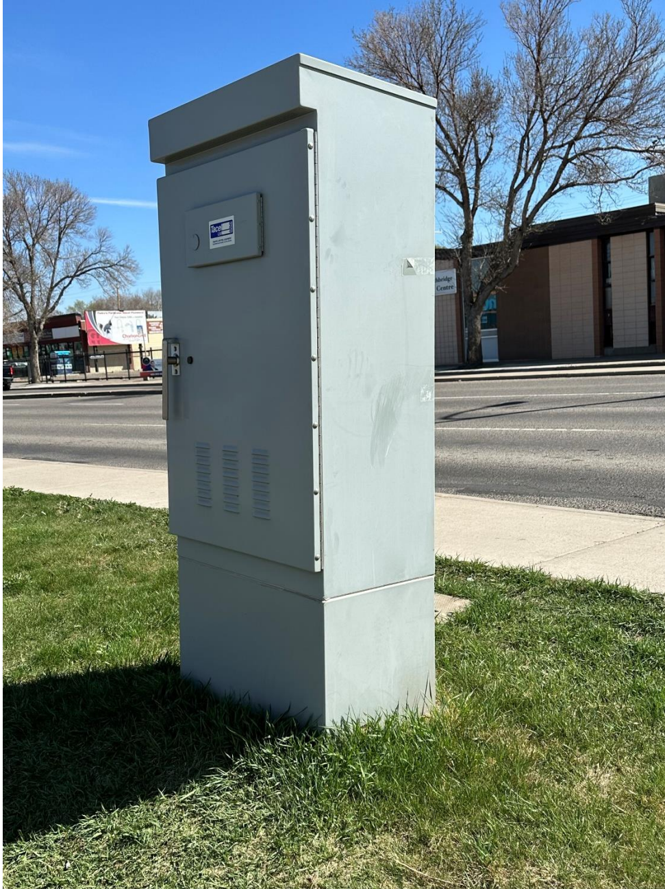
Location #6: 2 nd Ave N and 13 th Street N (Northwest corner) Cabinet model. Approximate dimensions: 62" (h) x 17" (d) x 30" (w)