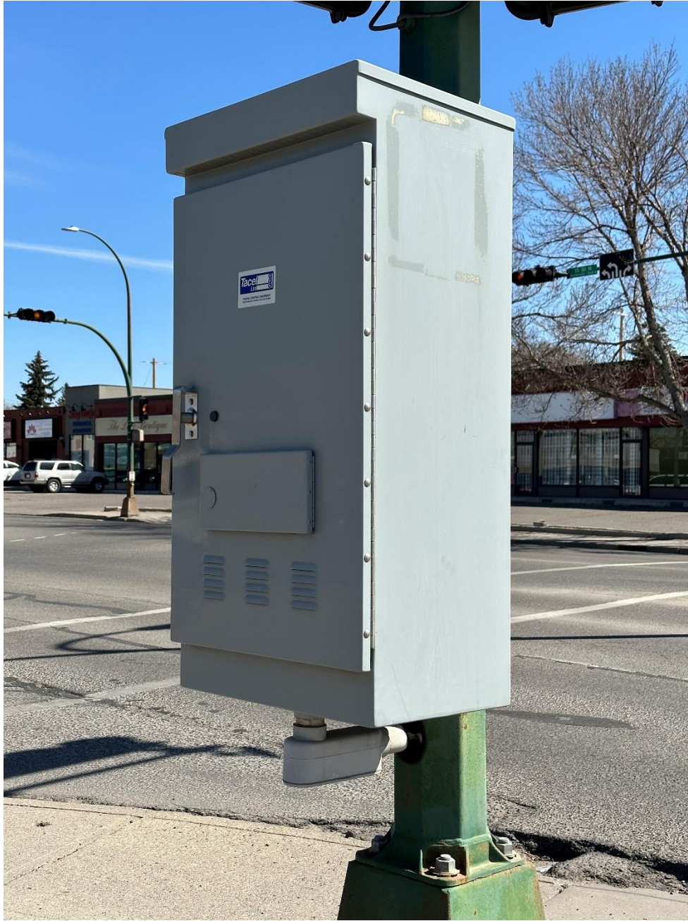
Location #5: 2 nd Ave A N and 13 th Street N Pole mounted. Approximate dimensions: 49.5" (h) x 15.75" (d) x 25" (w)